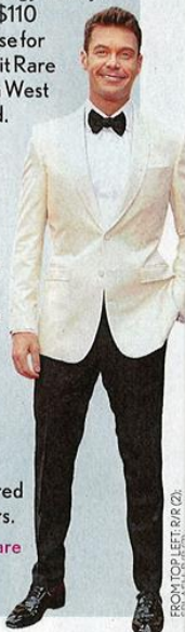
FROM TOP LEFT: R/R (2);