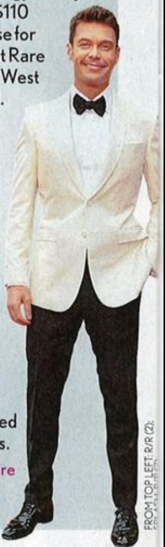
FROM TOP LEFT: R/R (2);